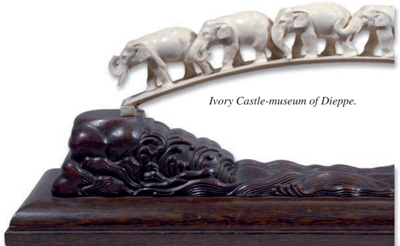
Ivory Castle-museum of Dieppe.