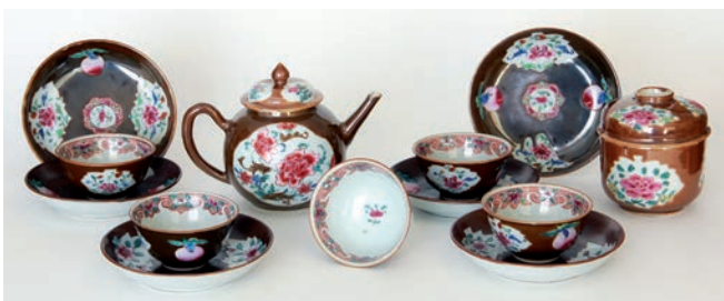
Porcelain, Compagnie des Indes Museum, Lorient.