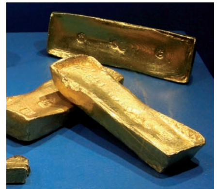
Gold ingot, Prince of Conti, Drasm India Company.