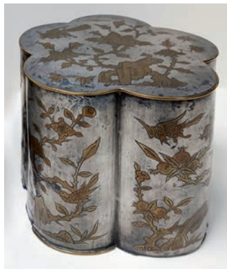
Painted tea caddy, Museum of the East