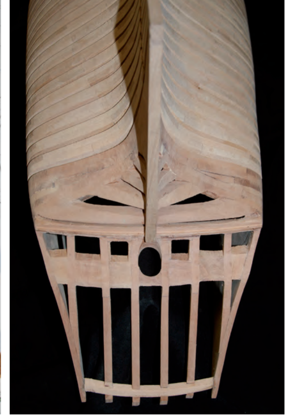
Photo 6: Pieces of the fore-and-aft structure partially completed. Keel, stempiece and false keel.